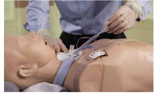
Figure 5. Remove tracheostomy ties and gently clean tracheostomy site with clean wash cloth