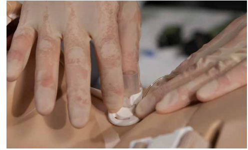
Figure 7. Insert the inner cannula into the tracheostomy tube and lock into place