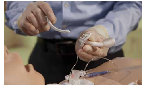
Figure 4. Insert obturator into tracheostomy tube and put a small amount of water-soluble lubricant on the tip of the tracheostomy tube