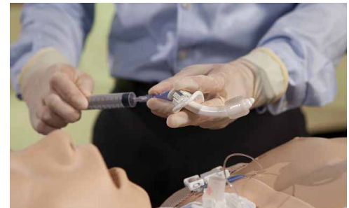
Figure 3. Examine all components of the new tracheostomy tube for defects and inject air into the cuff to test for leakage