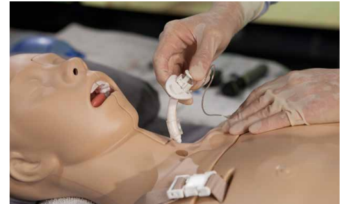
Figure 6. Insert tracheostomy tube into stoma using a curved motion