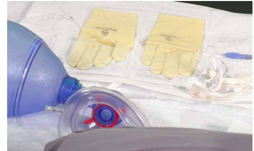
Figure 2. Place sterile field (usually glove packaging) on clean table and place new tracheostomy, obturator, tracheostomy ties, inner cannula, dressing, and water-soluble lubricant on the field