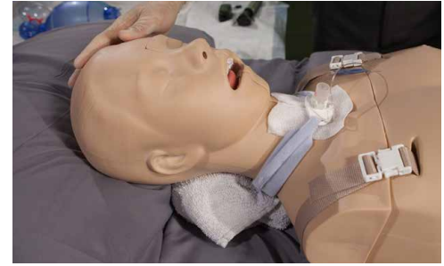
Figure 1. Patient positioned supine or semi-recumbent